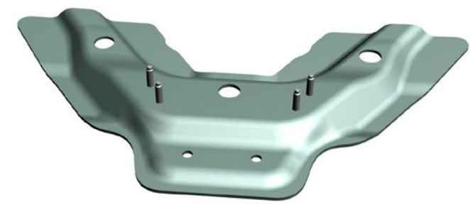
Another example of a wood-based CFC moulded part